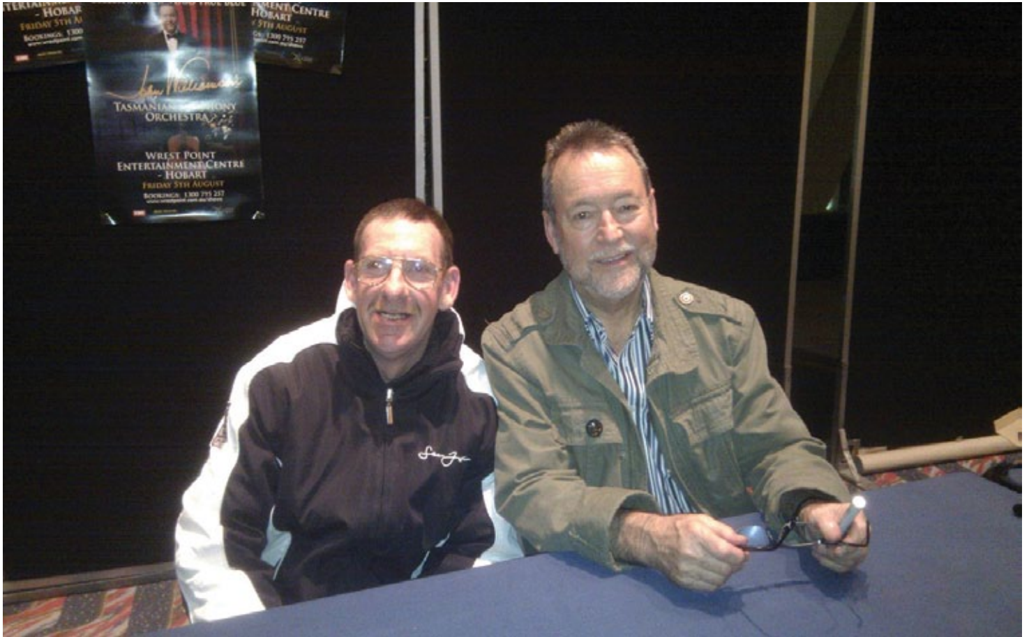
John Williamson and fan