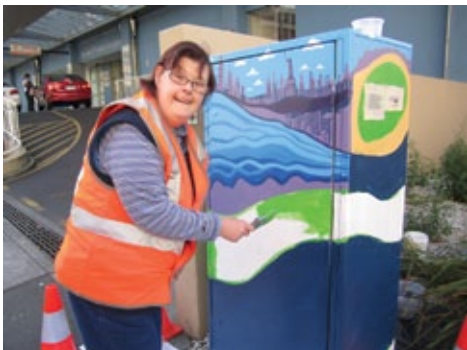
Decorated traffic light box