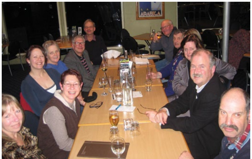
Board and residents enjoy a meal

On Tuesday 30 August a group of Lodge residents and several members of the Board enjoyed a lovely meal at Sails restaurant in Bellerive.